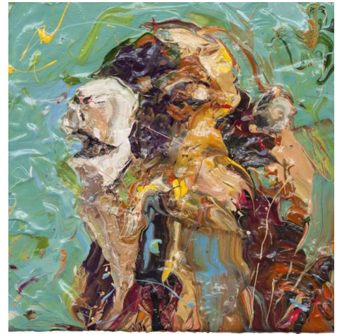
Camel Head 2011, Oil on canvas, 29.8 x 29.8 cm